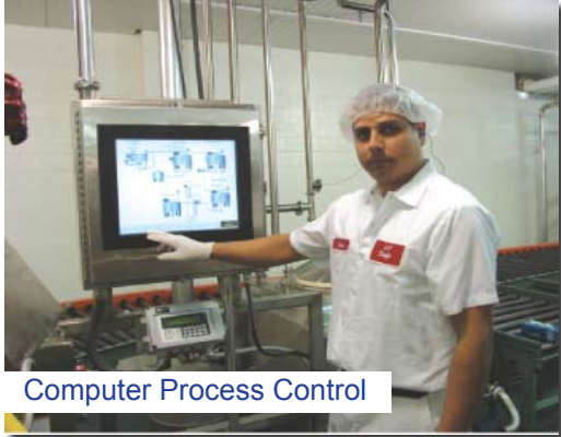
Computer Process Control